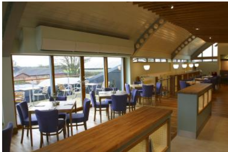
◀ Café (Handforth, 2003) – fitted into the curve of the roof due to planning restrictions on anything over storey