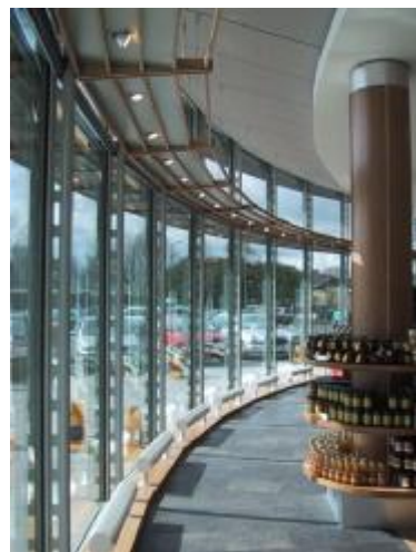
◀ Shop Glazing – the suspended structural glass wall to the entrance and the perforated mullions and shading to the curved wall provide great drama to the experience of shopping – this building is not just a shop, it is one of the foremost tourist destinations in the Lake District.