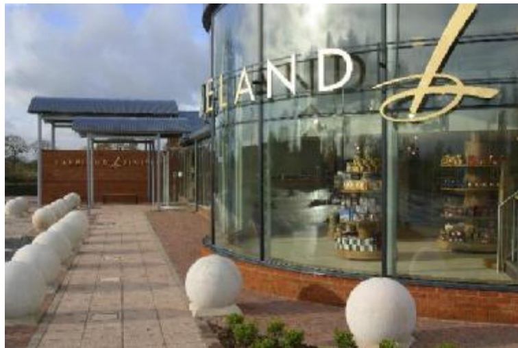
◀ Landscape & signage (Handforth, 2003) – a new shop in green belt, designed as a modern take on typical Cheshire agricultural buildings.