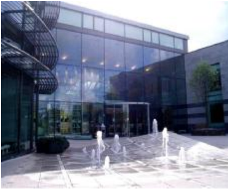
▼ Interactive fountains – finished construction showing programmed feature with 20 outlets set into paving

Lakeland Limited Shop, Windermere, 2003 National Civic Trust Award, 2007