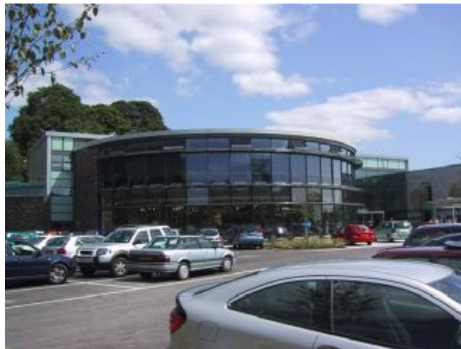
◀ ▶ Shop Approach – Above shows a computer rendering produced as part of the design process and used for the planning consultation; to the left is the finished shop; the curved wall provides dramatic views from the first floor cafe