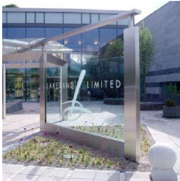
◀ Canopy and Signage – finished construction in etched glass and stainless steel; also shows paving, seating and landscape treatment