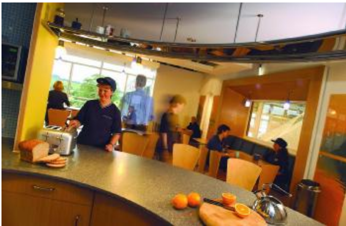
◀ ▲ Distribution Centre (Kendal, 2001) – several views of the dispatch building, staff café.