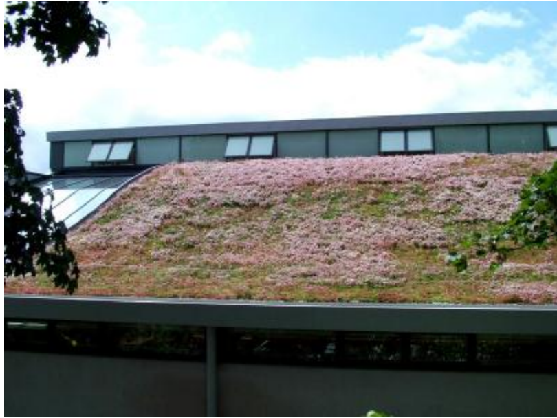
▲ Green Roof – the green roof over the shop changes throughout the year.