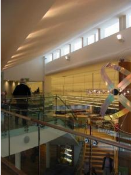
▲ Shop interior - the roof form provides generous daylight throughout the shop, reducing the need for artificial light.

Lakeland Limited Shop, Windermere, 2003 National Civic Trust Award, 2007