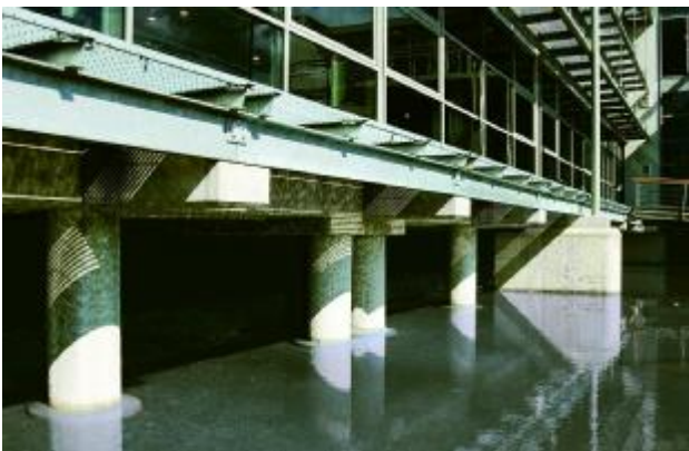
◀ Distribution Centre ▶ (Kendal, 2001) – making a feature out of the fact that the building is built on stilts over a flood plain..